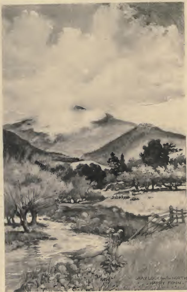
GRAY LOCK from the NORTH HARRY FENN.